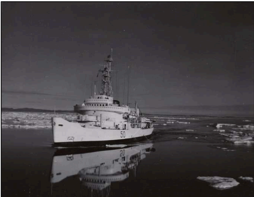
Figure 20. Labrador in Fury and Hecla Strait en route to Brevoort Island Harbour.