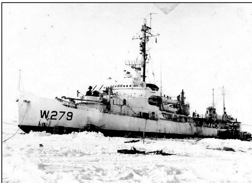
Figure 22. USCGC Eastwind in the ice.

eventually rupturing one of her forward tanks and losing eight hundred barrels of bunker fuel. Kankakee , who kept close astern of Labrador throughout, had no trouble whatsoever. When Edisto arrived, and offered assistance, Labrador was only too happy to turn over Memphis to her. By 1700 Labrador and her charge were into relatively open water west of George Island, whereupon the former set course back to Newfoundland.