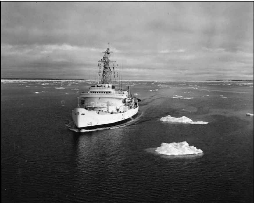
Figure 13. HMCS Labrador proceeding through Fury and Hecla Strait.

When the ship arrived at Site Three on the 9 th , the usual routine was carried out. Radar beacons were erected, beach obstructions cleared, and the beach and anchorage charted. Before all the charting had been completed the weather deteriorated and Labrador sailed for Site Two. At this Site the