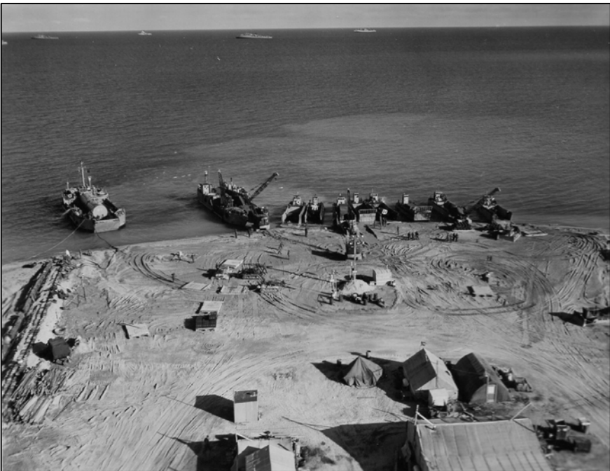
Figure 10. LCV and LCM craft unloading supplies on the beach at site 30.

The work of preparing Coral Harbour for the forthcoming supply operation began at once. It took Labrador less than three hours to break up the harbour ice, which was then carried out by a north-west wind and an ebb tide. By the following morning, 29 June, LCVPs were landing parties on the beach to erect day-mark beacons, and the helicopters were at work setting up triangulation beacons. The sound boat and the motor cutters were busily taking soundings. On the morning of the 30 th , both inner and outer harbours were almost completely clear of ice, and the divers, supported by volunteers from the ship, began to clear the landing area itself which, appropriately enough, was named Snafu Beach. It was not an easy task, as the beach was by no means ideal for unloading operations with LCUs and LCMs, 60 the gradient was not sharp enough, and the approaches full of shoals, rocks, and other obstacles. It was not very difficult for the divers to remove or destroy with explosives all the chief underwater obstacles, but it was left to the civilian contractor to fill in the beach so that the landing craft could unload at all stages of the tide. Before the ship left the area, good charts were prepared, tracings of which were left behind for the use of the US ships which would be using the harbour.