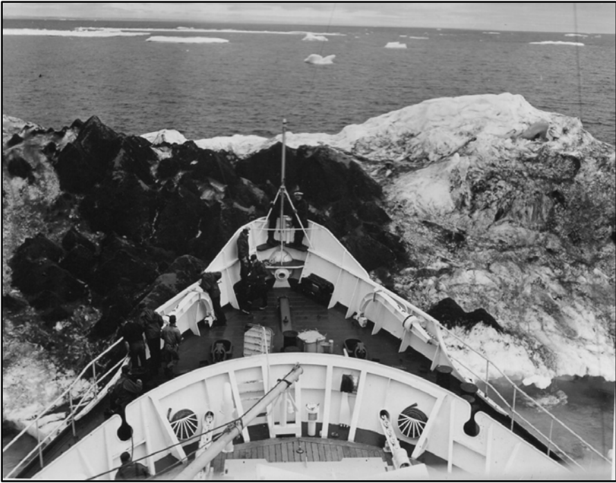
Figure 14. Iceberg from which Labrador collected soil samples enroute to Brevoort Island, 1956.

table. In his Report of Proceedings the Commanding Officer hints that perhaps this little incident may have had something to do with the subsequent decision to abandon the uncompleted survey of Site One.