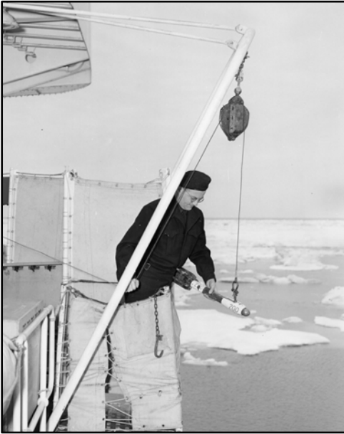
Figure 7. Taking salt water samples in the Gulf of St. Lawrence.

When the LCVP had been brought on board, Labrador sailed for Cape Kellett, the most westerly tip of Banks Island. For the next eleven days she cooperated with the two US ships in taking soundings and carrying out bathymetric surveys in Amundsen Gulf and the Beaufort Sea in the area between Banks Island and Cape Halkett on the Alaskan coast. In addition to helping the Beaufort Sea Expedition in this work, Labrador continued her own scientific duties in oceanography and hydrography and in experimenting with the Admiralty Gyro Magnetic (AGM) compass. Her last