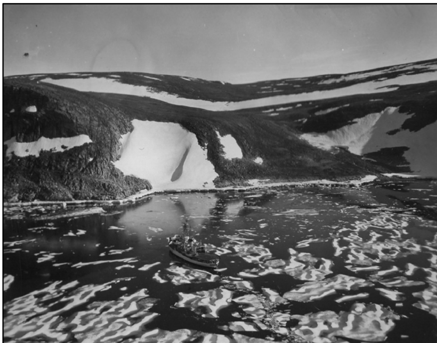
Figure 16. HMCS Labrador in Brevoort Harbour.

For four days Labrador remained at Brevoort Harbour surveying the inner and outer harbour and clearing the landing beaches. The ice in the harbour was fortunately much lighter than that outside, and after Labrador had churned it up several times much of it drifted out. “Pogo,” the sounding boat, and the two specially-strengthened motor cutters did most of the work in the inner harbour, while Labrador carried out soundings in the heavy pack-ice in the approaches. The weather was of great assistance: calm, sunny, and relatively warm, permitting the most effective use to be made of the boats and helicopters. Had it remained foggy and cold the four-day Brevoort survey might have taken weeks.