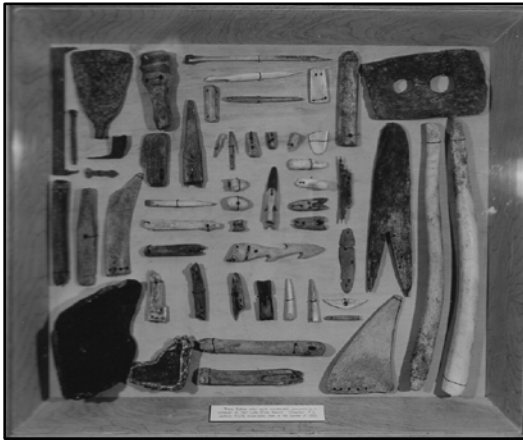
Figure 11. A display of Inuit artifacts found at site 30 in 1955.

On 21 July, Labrador arrived at her destination, a site on Melville Peninsula at the north end of Foxe Basin. Here the routine was much the same as at Coral Harbour: a thorough survey and charting of the beach, clearance of navigational hazards where possible, and a survey of the anchorage area. Day-mark beacons surmounted by a radar reflector made from old oil drums were erected to assist future navigators entering the area. The entire operation took one week, but it was not all work and no play. The ship's company scraped up a softball team which managed, in a close if not well-played game, to beat the locals by a score of twenty-four to twenty-three. The Medical Officer was flown to the settlement at Igloolik Island,