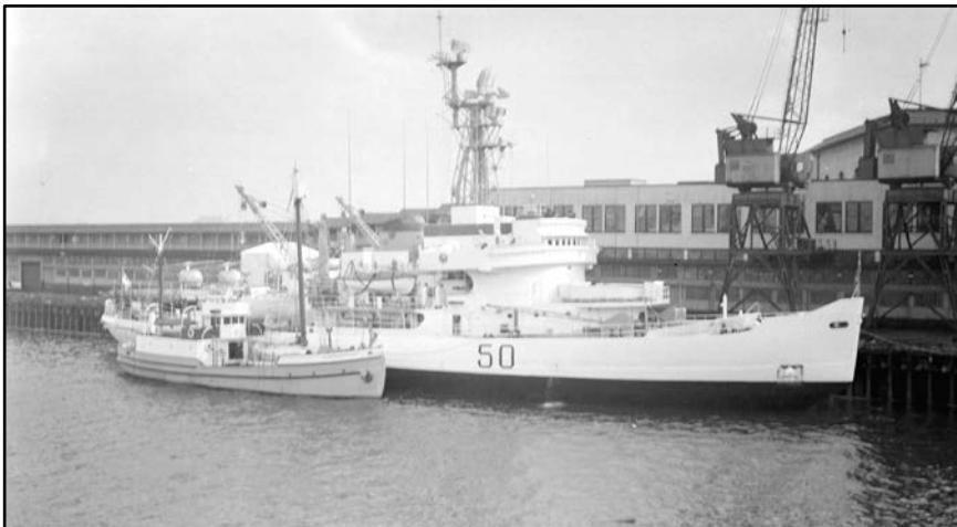
Figure 8. St. Roch and HMCS Labrador at dock in Vancouver, 1954.

Labrador sailed for Vancouver on the morning of 12 October, and arrived there that same day. Off Point Atkinson she made contact with the RCMP Schooner St. Roch , still under her famous commander,