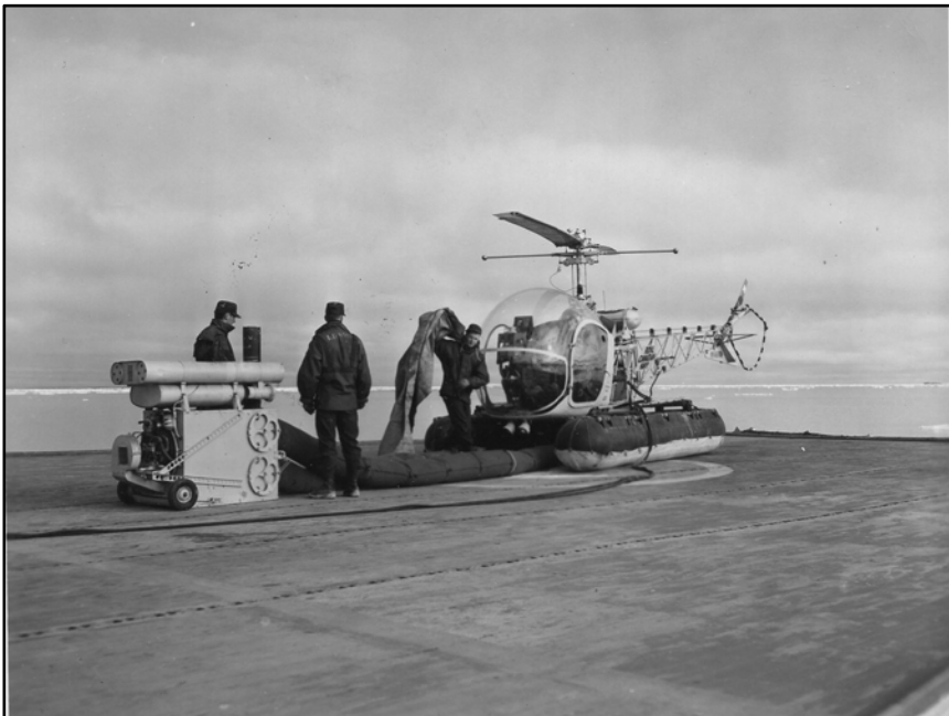
Figure 6. Flight deck crew warming up a Bell helicopter with a Herman Nelson heater.

After retrieving the air drop Labrador anchored, planning to lay to for the night. Shortly before midnight, however, a message arrived from