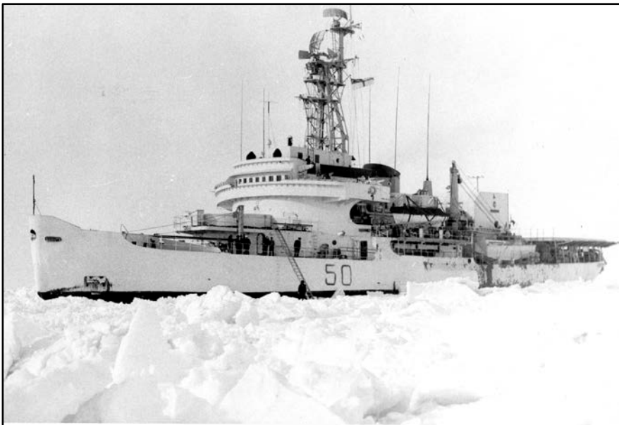
Figure 21. Labrador in ice in the Gulf of St. Lawrence, 1956.

Labrador arrived at Montego Bay, Jamaica, on the 15 th and remained there for two weeks while the ship was being painted. Montego Bay proved to be a pleasant spot; the inhabitants were very friendly, and full use was