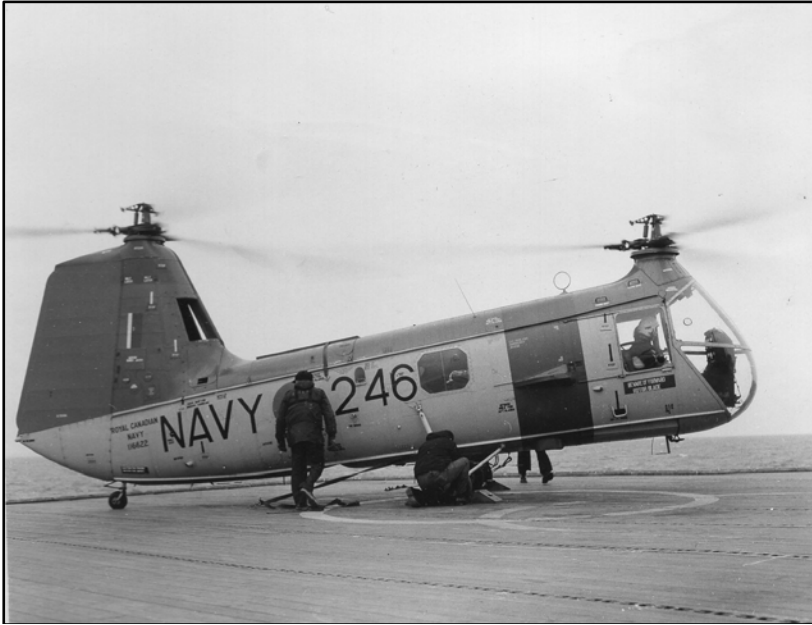
Figure 9. A HUP helicopter aboard the Labrador.

On 1 June, 1955, Labrador sailed on summer operations. As in 1954 preparations had been rushed, and the final draft only embarked at the last moment, after the brow had been landed and most of the lines cast off. Immediately upon leaving Halifax, Labrador ran into fog which persisted for several days. Entering the Gulf through Cabot Strait the ship made for the Strait of Belle Isle, where oceanographic and hydrographic work was to begin. On the morning of the 5 th , however, course had to be reversed in order to land the Commanding Officer and Staff Officer at Stephenville, Newfoundland. They had been called to Washington to discuss DEW Line sea-lift problems with the Commander Task Force 6, the US naval group responsible for this operation. While her commander was absent Labrador continued with scientific projects in the Belle Isle area, heading south again to pick up the officers when they returned on the 8 th .