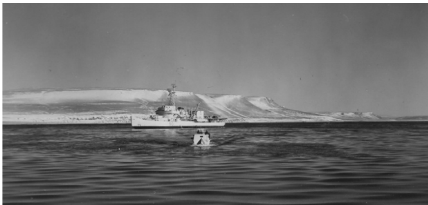
Figure 18. LCVP proceeding ashore to Beechey Island from Labrador.

for three weeks, were set down in Labrador Channel to complete the sounding of this important route. An LCVP was also lowered to pick up the cache left on the 21 st and move it to a more accessible place. No sooner had the boats got away and Labrador turned back to Rowley than a blinding snow-storm, the first of the season, swept in from the north, reducing visibility to zero. The storm had no serious effects, though at its height the LCVP ran aground and did not get back to Rowley until the following morning.