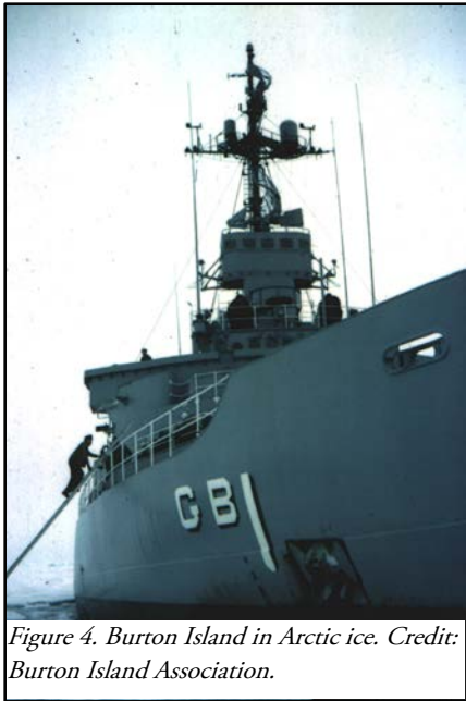
Figure 4. Burton Island in Arctic ice.

important decision. Should she succeed in reaching the Pacific, she would become the first naval vessel, and indeed the first large ship of any description, to complete the Northwest Passage. Perhaps more important, she would become the first large ship to complete the Passage in one season.