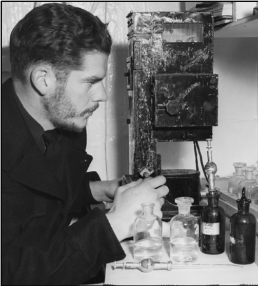
Figure 15. Scientists aboard Labrador undertake sea water studies.