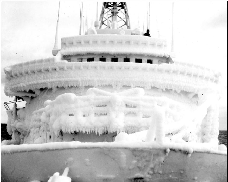
Figure 2. The bridge and fo'c'sle of HMCS Labrador under ice as the ship passed through the Gulf of St. Lawrence. Credit: DND, Directorate of History and Heritage, Ottawa.

It was the region of islands, the Canadian Archipelago itself, that was the scene of most of Labrador's activities, but it is very difficult to describe except by means of a chart, as it is a veritable maze of islands separated by innumerable gulfs, sounds, bays, inlets, and straits. On a gnomonic projection it appears roughly triangular in shape, with Baffin, Somerset, Prince of Wales, Victoria, and Banks Islands forming the base, and the great mass of Ellesmere Island the apex. The east side of the triangle is made up of the southern projection of Ellesmere, Devon Island, and the northern projection of Baffin. The west side consists of Banks, Prince Patrick, Borden, Ellef Ringnes, Meighen, and Axel Heiberg Islands. The islands in the centre of the archipelago are most of them smaller in size than those