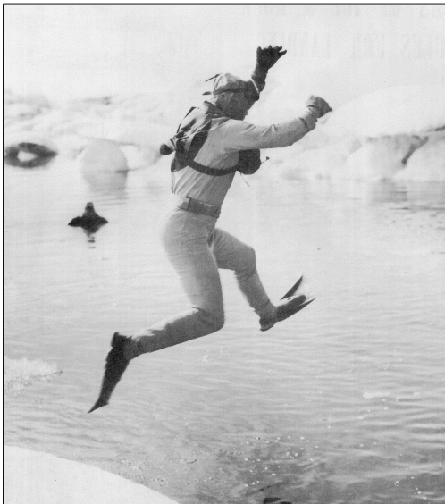
Figure 23. Frogman in the ice. In United States Navy. Military Sea Transportation Service. Arctic Operations: Public Information Report, 1957.

After recovering the climbing party, Labrador returned to Frobisher Bay to land Commodore Quinn and then sailed back to Resolution Island.