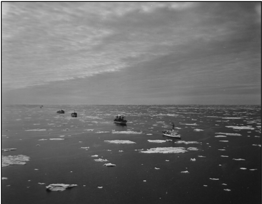
Figure 12. HMCS Labrador leading a convoy through Foxe Basin, August 1956.

In spite of all the difficulties encountered, the operation had been very successful. Though the ice had been very heavy, averaging six to eight